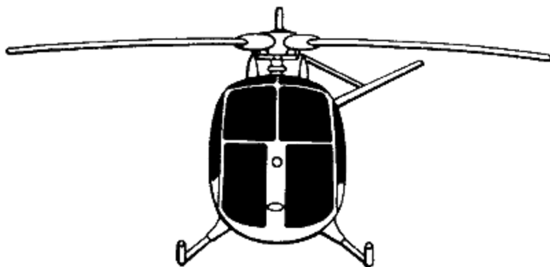
Hughes 500 Airframe and Tail Boom Jig Tooling and Main Gearbox Run-in stand and drive