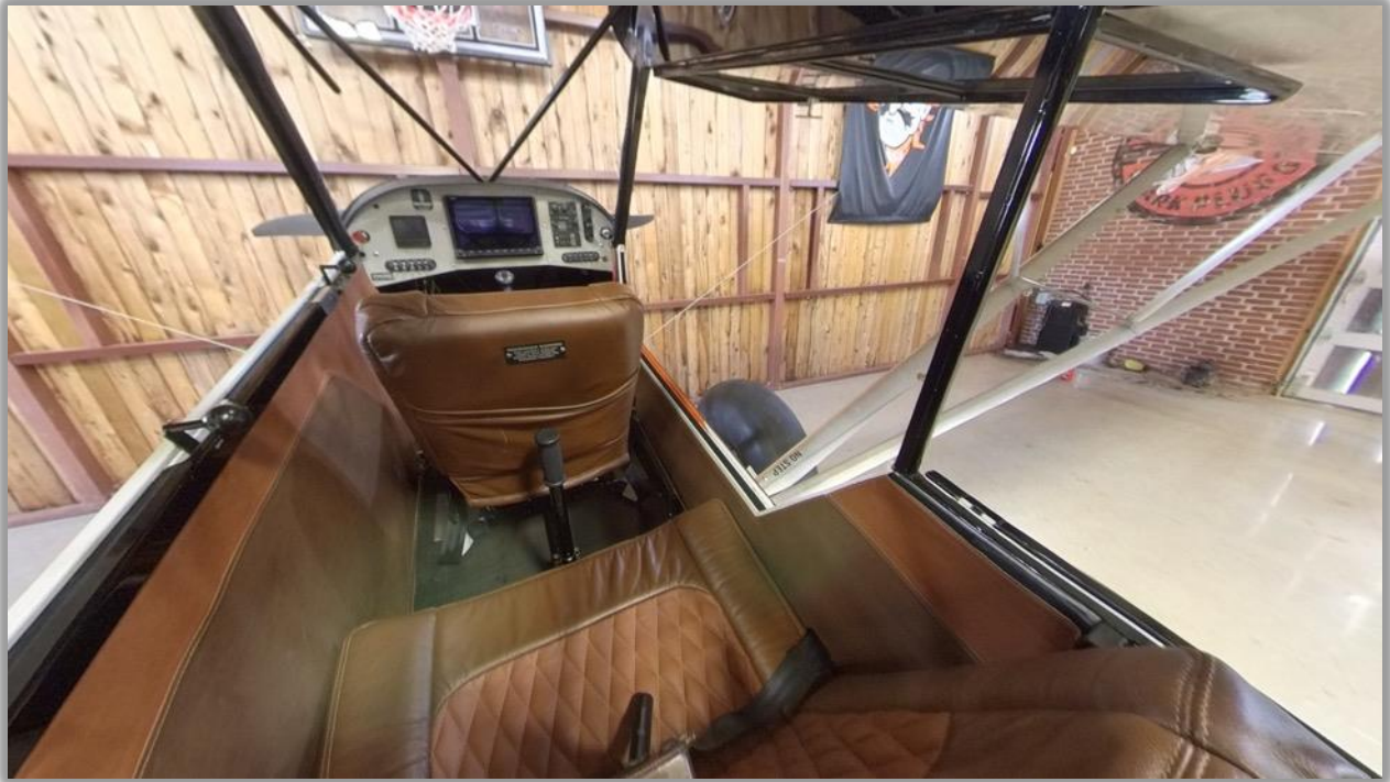
Three Openable Windows: Left & Right Side Pilot, Right Side Passenger