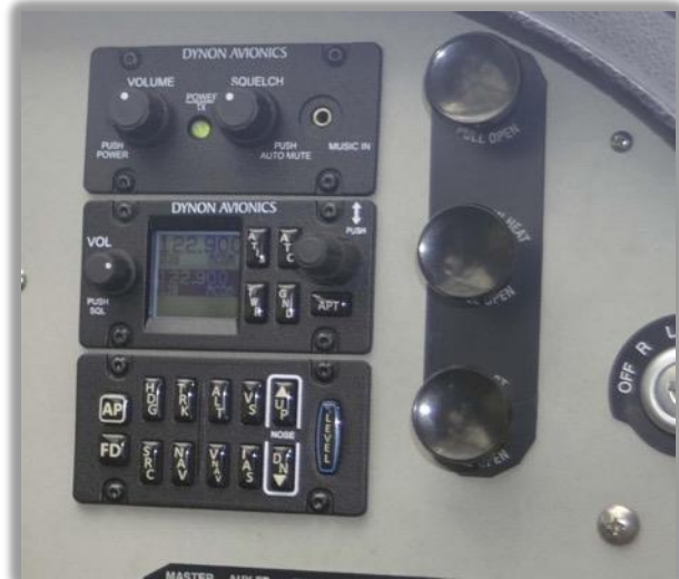
Autopilot, Integrated Com, Stereo Audio