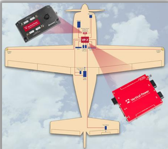
Integrated Power & Circuit Protection