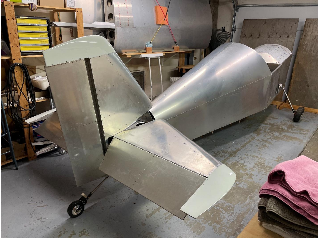
Rolling Fuselage – Rear View