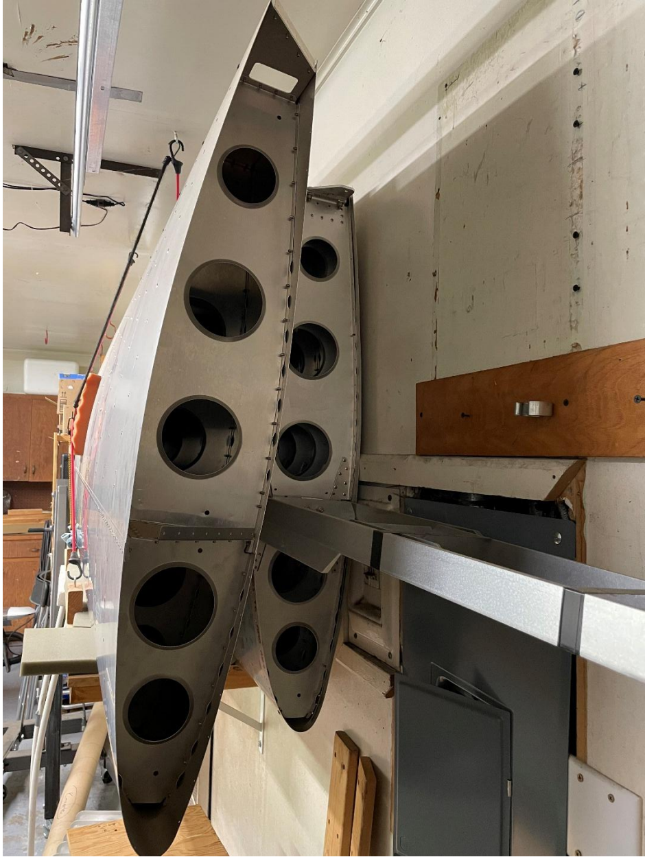
Wings - Side View