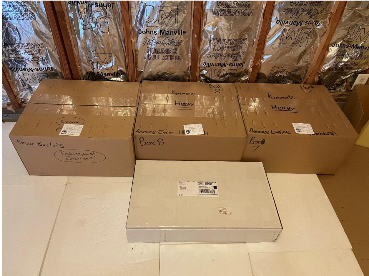
Engine Boxes and Cooling Baffles Kit