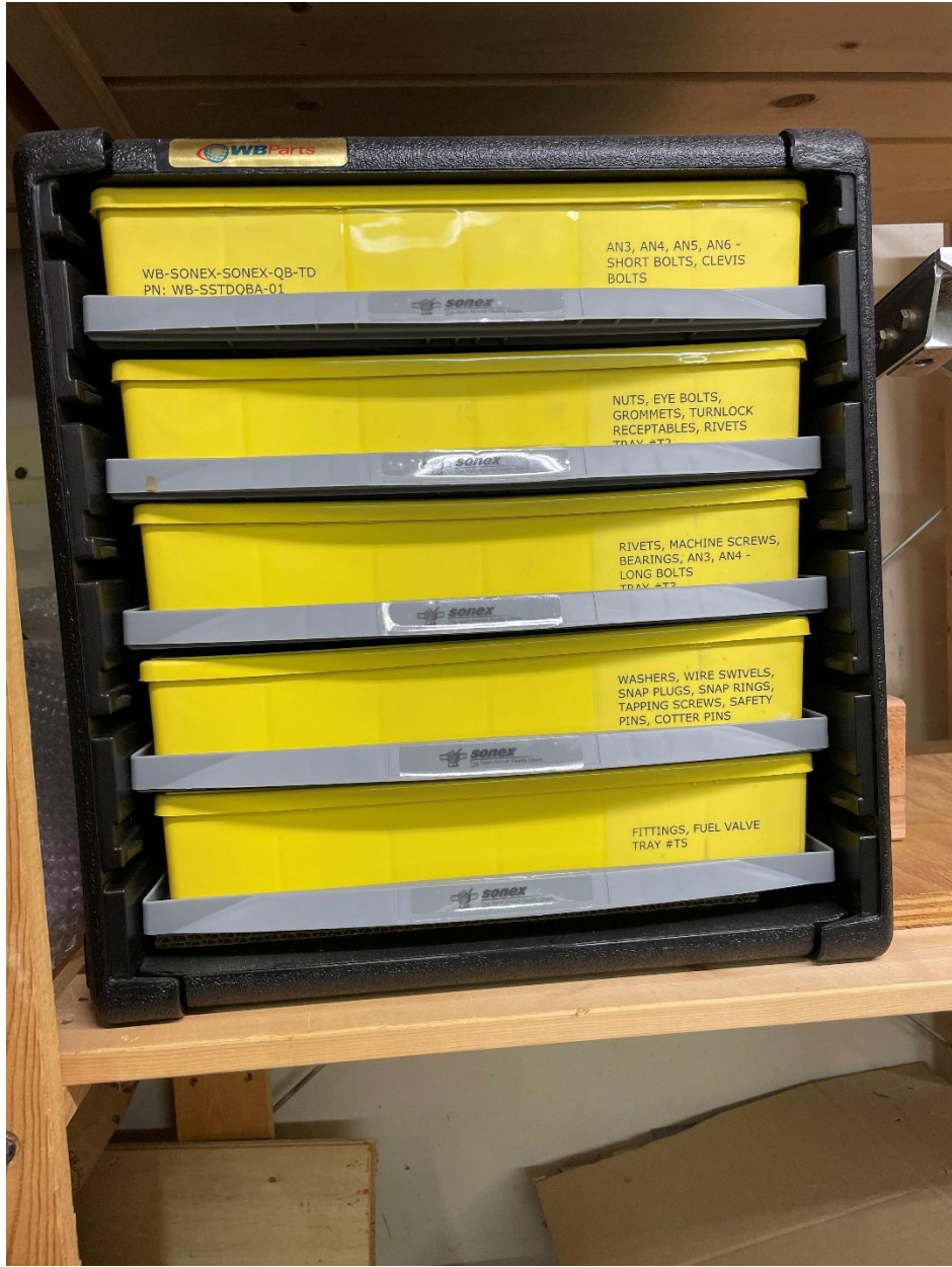
WB Parts Fastener and Accessories Kit