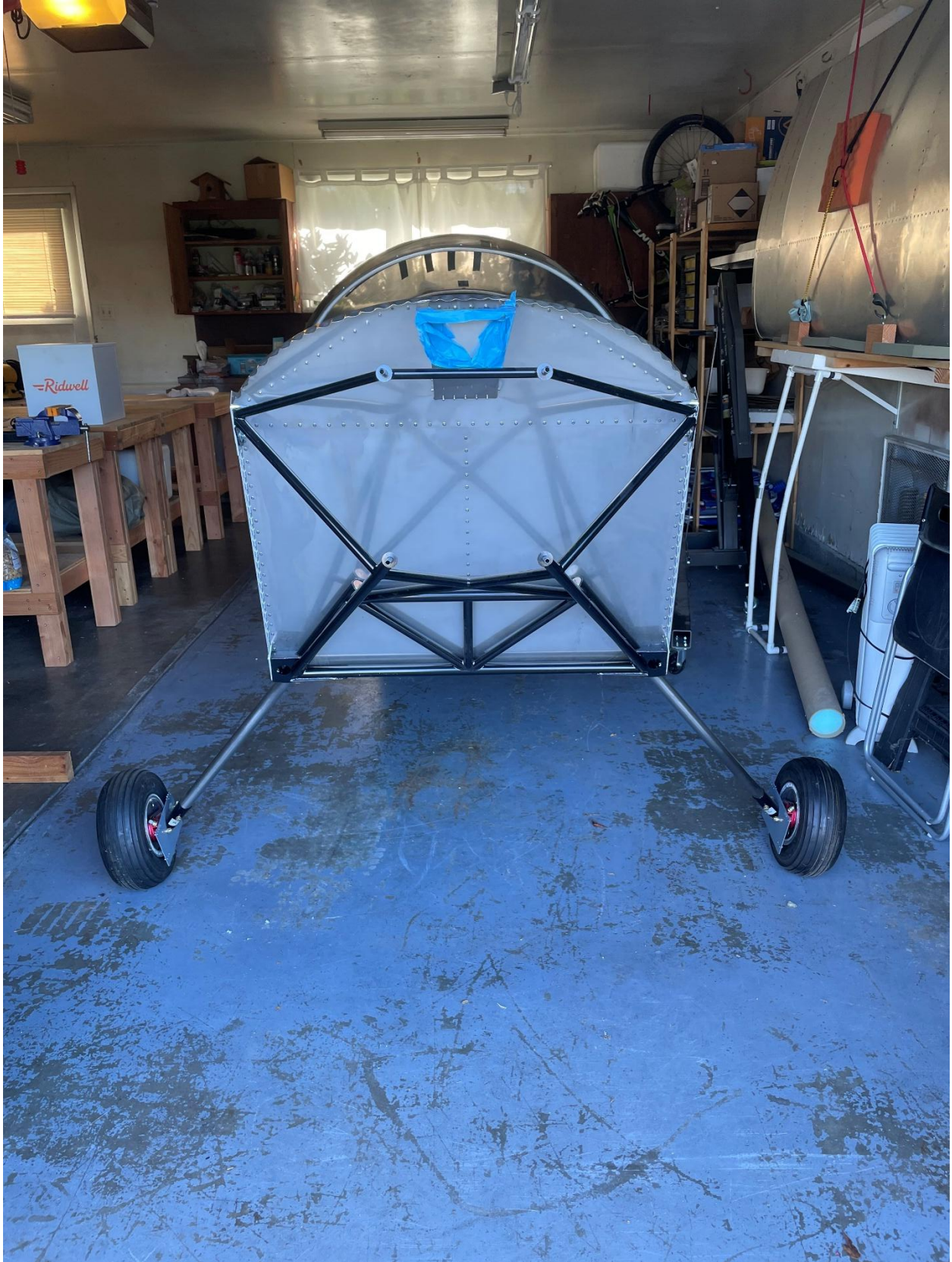
Rolling Fuselage - Front View