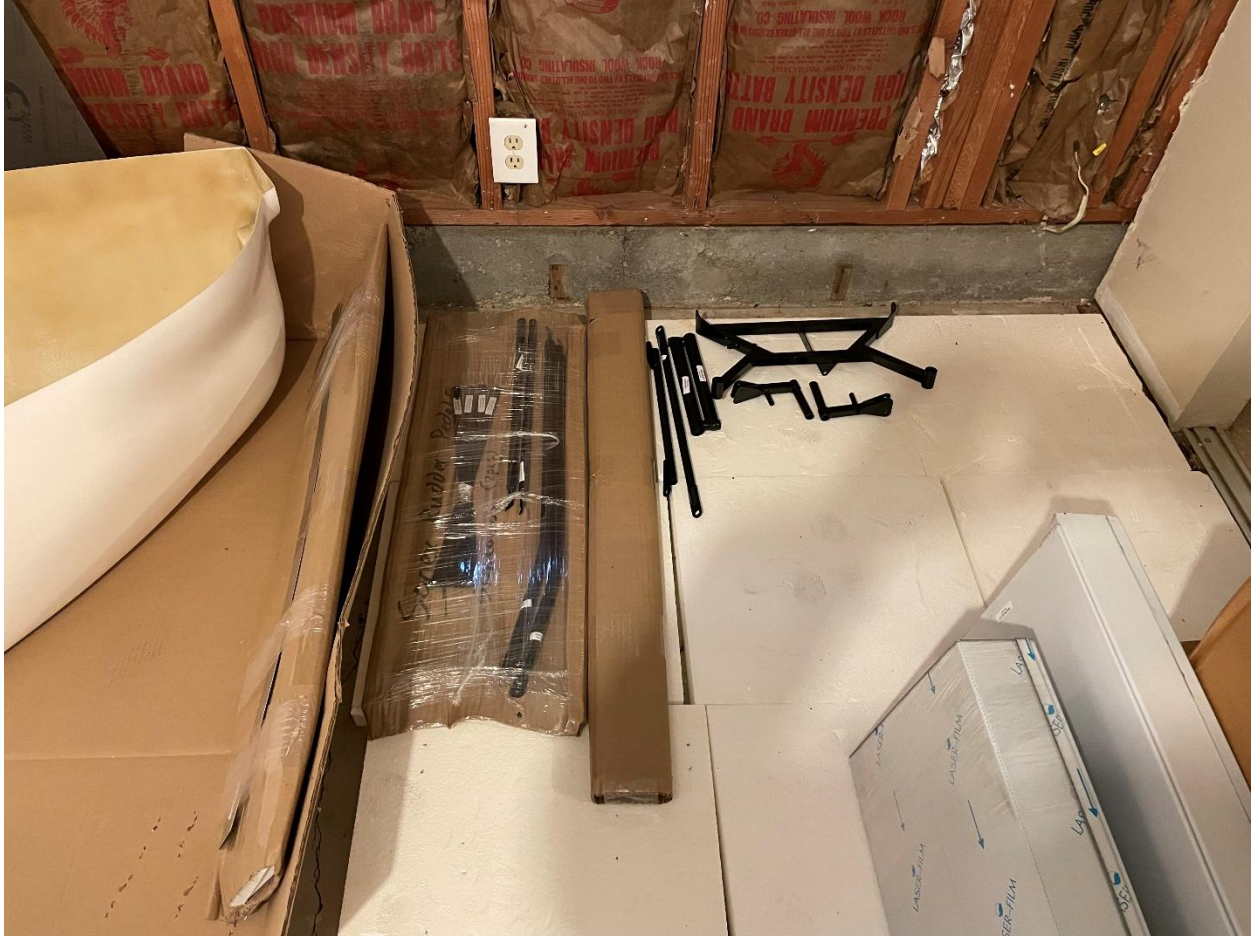
Various Control Rods and Pedals