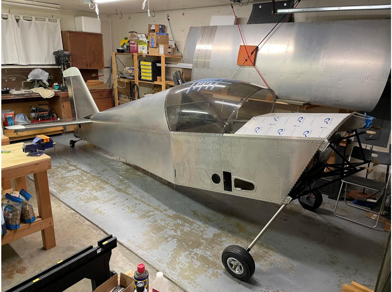
Rolling Fuselage – Front View with Canopy