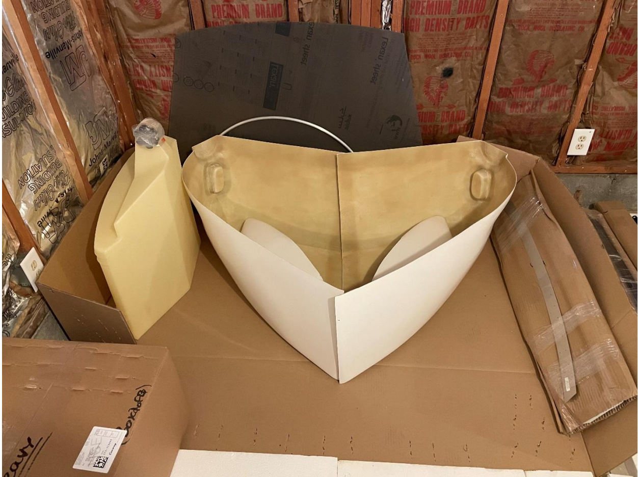
Engine Cowling, Fuel Tank, Windscreen, and Accessory Parts