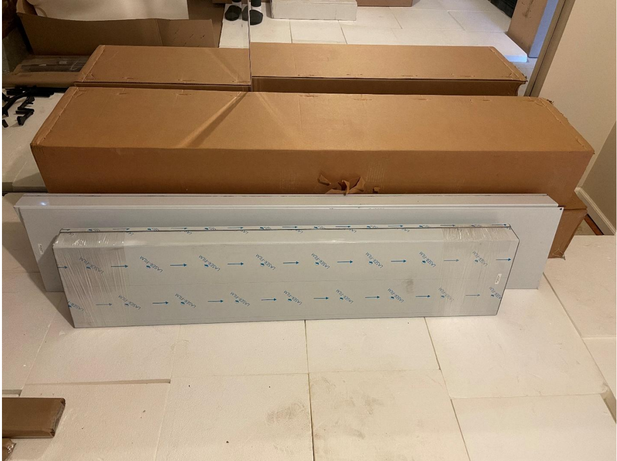
Flaps and Ailerons Stock